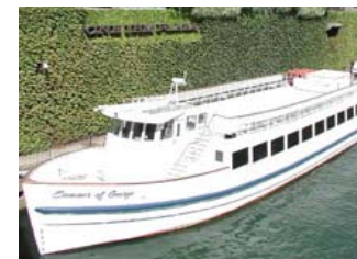
Summer of George

An Exclusive Charter for EESF Featuring: Hors d'oeuvres, Entertainment, Open Bar and Fireworks